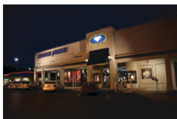
Visit the Friendly Staff at Houston Jewelry