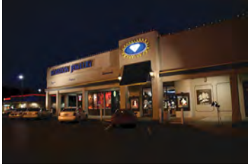
Visit the Friendly Staff at Houston Jewelry