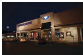
Visit the Friendly Staff at Houston Jewelry